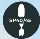
NET AND PARACHUTE

The SkyWall launchers can be used with a range of SkyWall projectiles. There is a parachute projectile to control the descent of the captured drone, minimising collateral damage risk. If the parachute is not required, the net-only projectiles can offer an increase in range and capture rate.